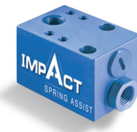
IMPACT™ Spring Assist