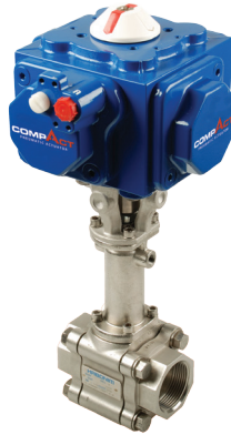
Fugitive Emission (FE)