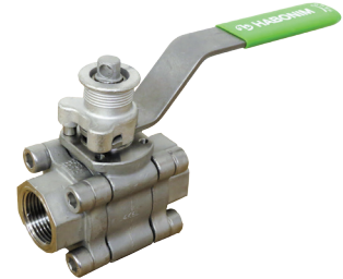
Spring-Loaded Locking Device (LD)