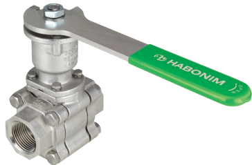
Spring Return Handle (SRH)